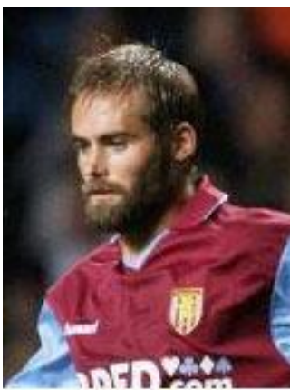
Obi Wan Kenobi